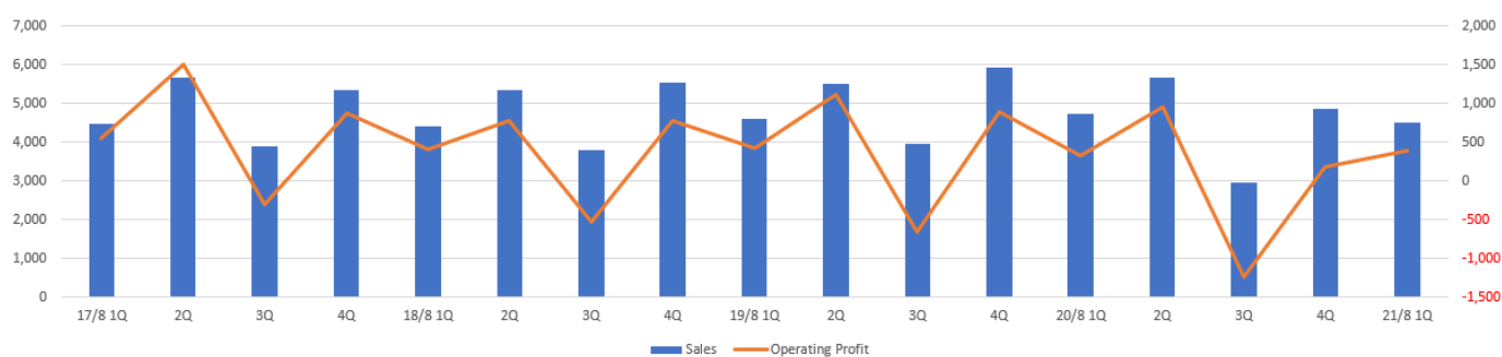
Variations in quarterly sales and operating profit (million yen)

The sales of the first quarter of FY ending Aug 2021 were 4,502 million yen, down 5.1% year on year. The sales of Meiko Gijuku directly operated school business increased as the summer course period was extended from Jul.-Aug. to Jul.-Sep., but the sales of Meiko Gijuku franchised school business, which are located mainly in local areas, declined, because the speed of recovery was gentle compared with the schools in urban areas. Operating profit rose 21.0% year on year to 396 million yen. Due to the drop in sales, gross profit and gross profit margin decreased, but thanks to the cost reduction at the headquarters and the disappearance of goodwill amortization, which was posted in the same period of the previous year for Meiko Gijuku directly operated school business, profit increased. The profit from Meiko Gijuku directly operated school business improved year on year from the negative value to a positive value, while the profit from Meiko Gijuku franchised school business dropped. Net profit grew 59.0% year on year to 311 million yen, thanks to the posting of gain on sale of investment securities, the decrease of tax burdens, etc.